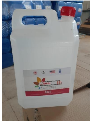
Waste Vegetative Oil Recycle Bin (5 lt)