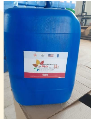
Waste Vegetative Oil Recycle Bin (20 lt)