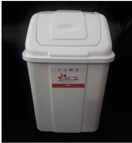
Organic Waste Bin (5 lt)

Tender was published on 5 March 2020 and closed on 19 March 2020. Contract was signed between UNDP and company on 7 May 2020. Equipment were delivered to the related municipalities on 10 June 2020.